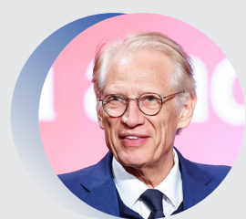
Dominique de Villepin

“The world finds itself at a historical crossroads with an uncertain path forward. Over the past three decades, the ‘successes and excesses’ of globalisation had both lifted hundreds of millions of people around the world out of poverty and established an infrastructure for a global economy, while also stretching supply chains and leading to vast increases in inequality. In charting a course forward, three key obstacles must be tackled: growing anarchy, growing disruptiveness of geopolitical rivalries, and growing privatisation of natural resources. While competition cannot be avoided, there’re three pragmatic goals to overcome these challenges: counterbalancing protectionism, limiting zero sum relations, and fostering win-win situations.”