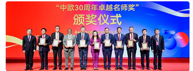
CEIBS Professors are each presented with the "CEIBS 30th Anniversary Outstanding Faculty Contribution Award"