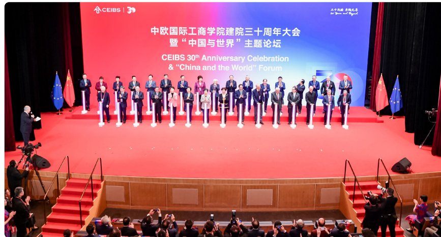
The launch ceremony of a new building to be constructed on the CEIBS Shanghai campus

CEIBS alumni will continue to demonstrate responsibility and unity, supporting their alma mater's mission to become the world's most respected international business school, he concluded.