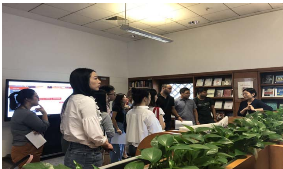
MBA 2020 Student Library Orientation

The library team has provided 36 training sessions through 2018. Flipping classroom was used in the new MBA student library instruction session and it showed a great result on increasing library interactions and attracting students. Students and librarians gained a close communication through this year's activities and the library become a popular place which students prefer to go to.