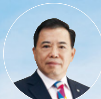
Li Dongsheng (CEO 2003) Chairman & CEO, TCL Group