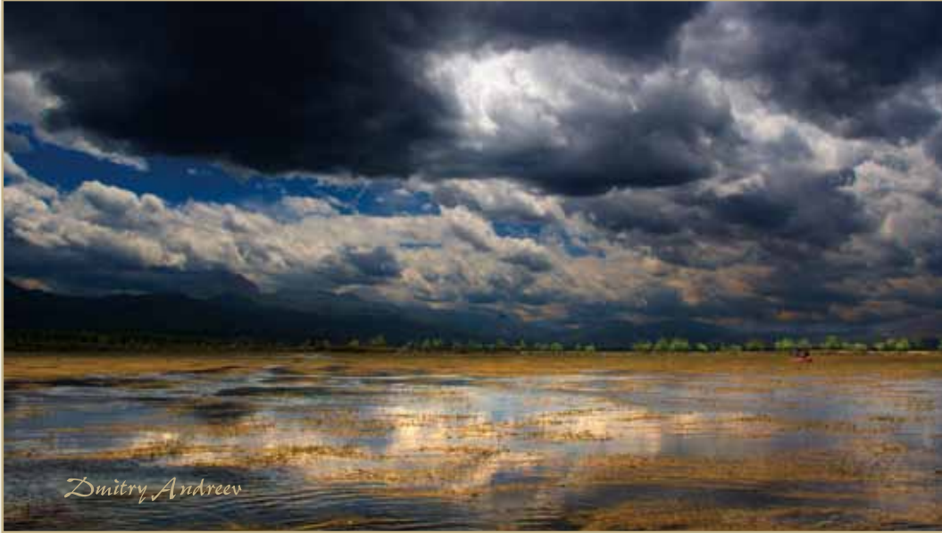
Location: Lijiang Date: April 2015

In just one second the seemingly tranquil landscape can explode into a merciless thunderstorm... this is the real charm and magic of mother nature.