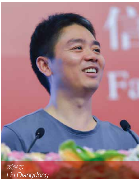
刘强东 Liu Qiangdong