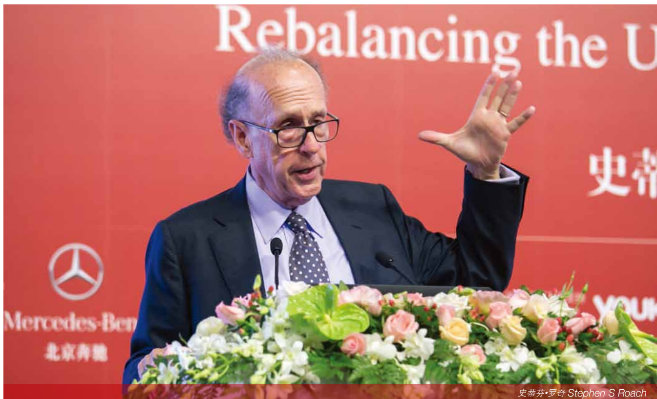
史蒂芬·罗奇 Stephen S Roach