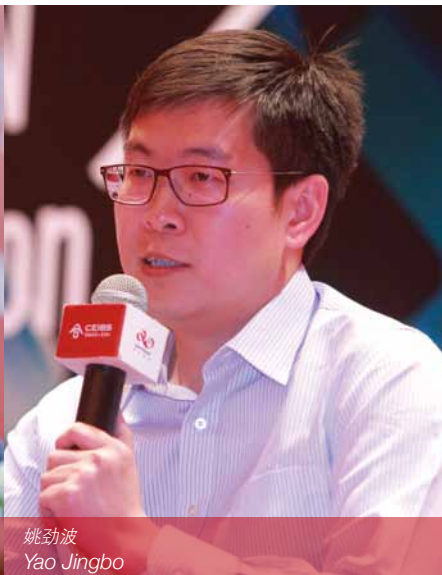
姚劲波 Yao Jingbo