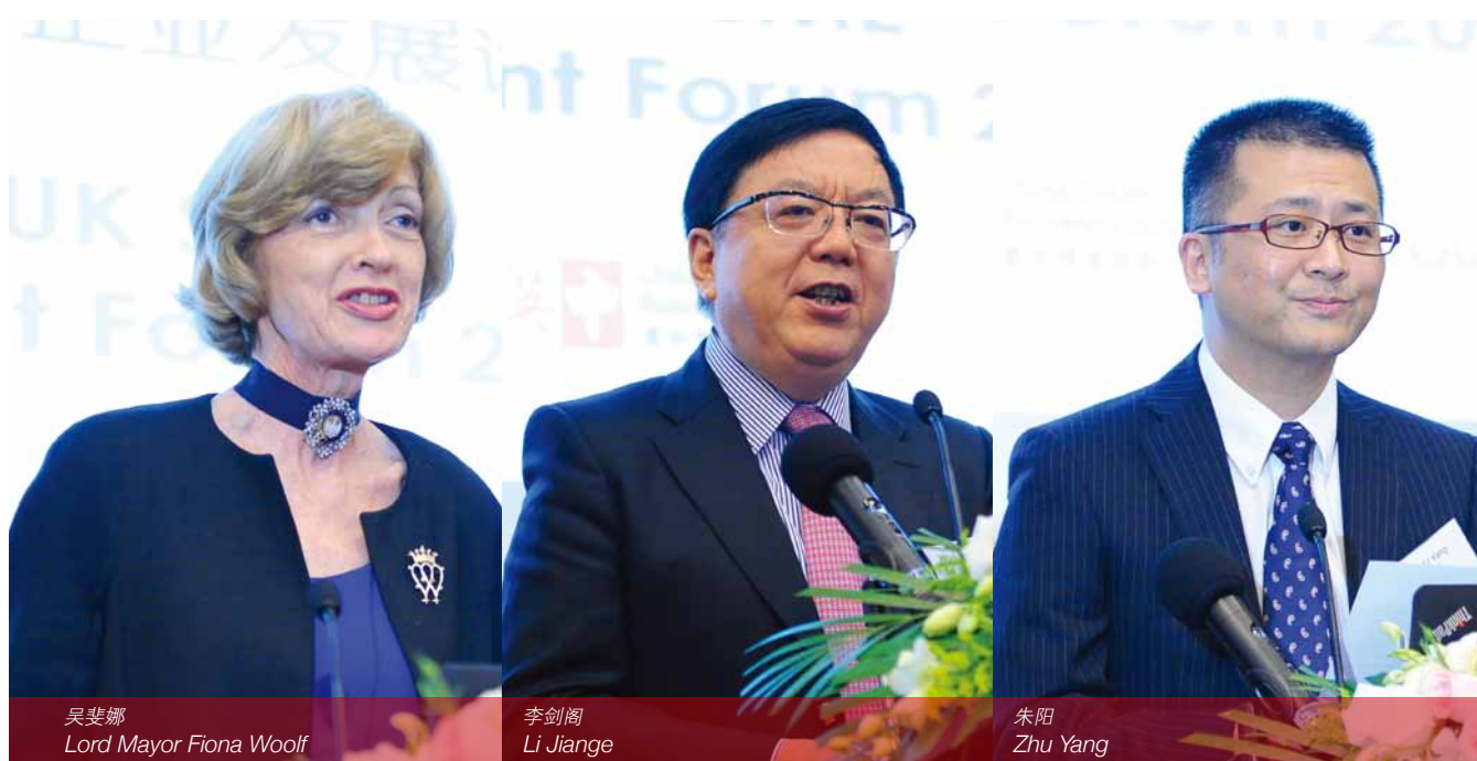
吴斐娜 Lord Mayor Fiona Woolf