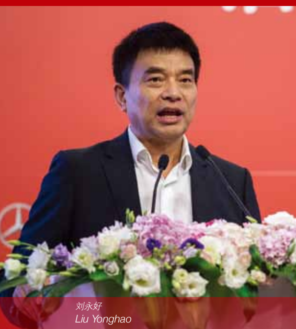
刘永好 Liu Yonghao