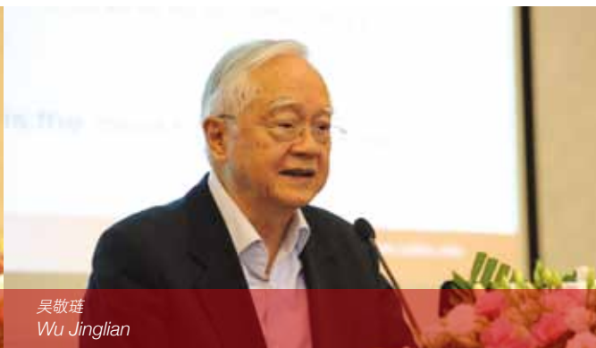
吴敬琏 Wu Jinglian