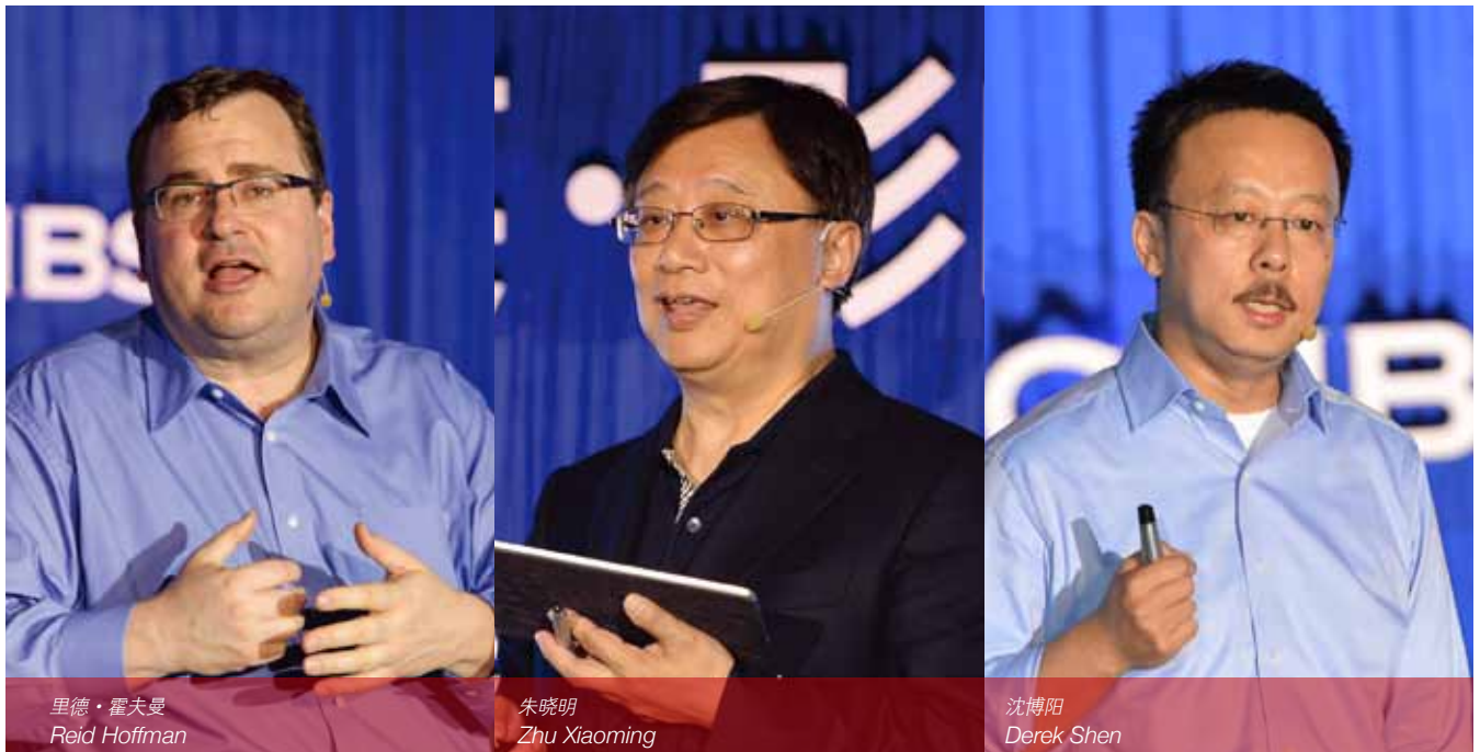
里德·霍夫曼 Reid Hoffman