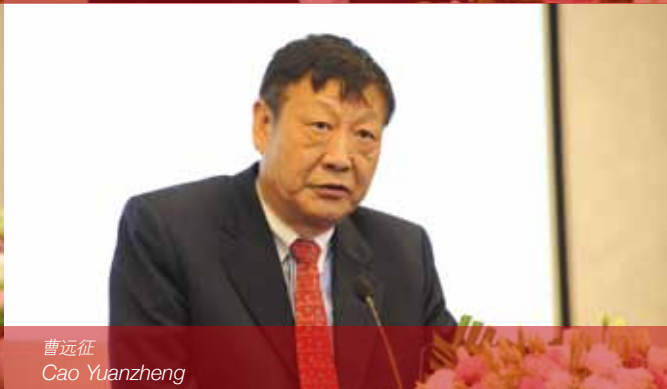
曹远征 Cao Yuanzheng