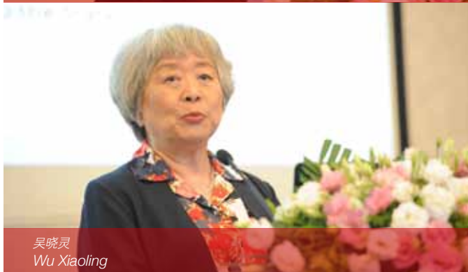
吴晓灵 Wu Xiaoling