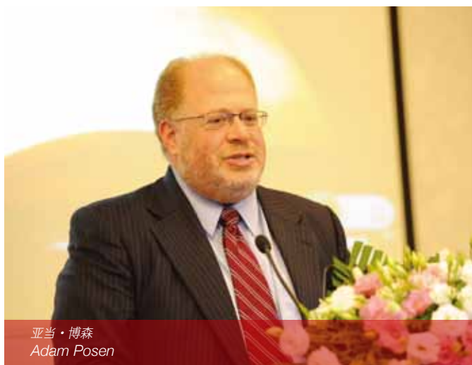
亚当·博森 Adam Posen