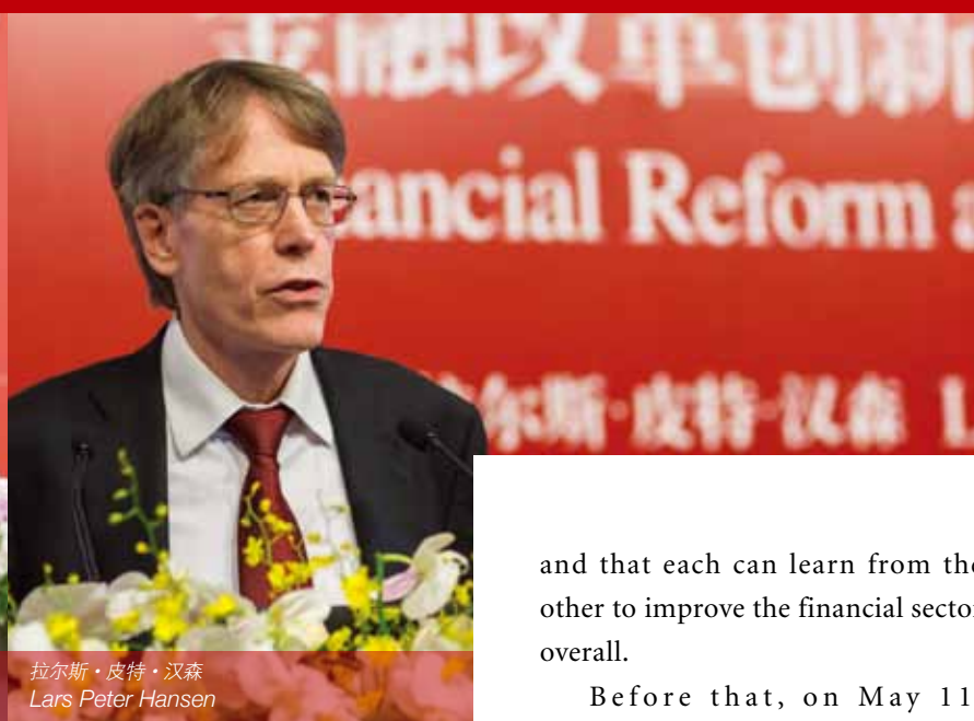
拉尔斯·皮特·汉森 Lars Peter Hansen