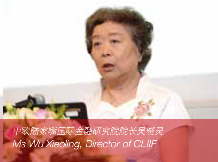
中欧陆家嘴国际金融研究院院长吴晓灵 Ms Wu Xiaoling, Director of CLIIF